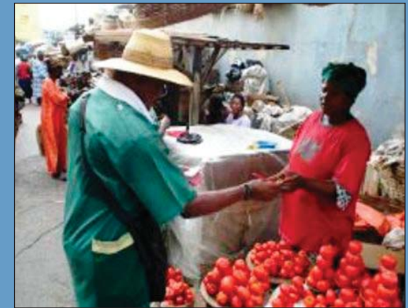
susu collector and customer-in Ghana