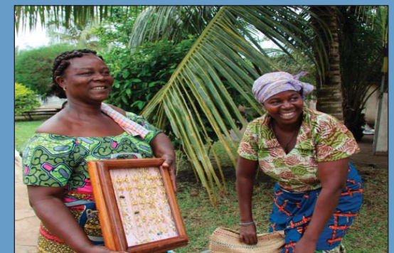
Susu Women Collectors