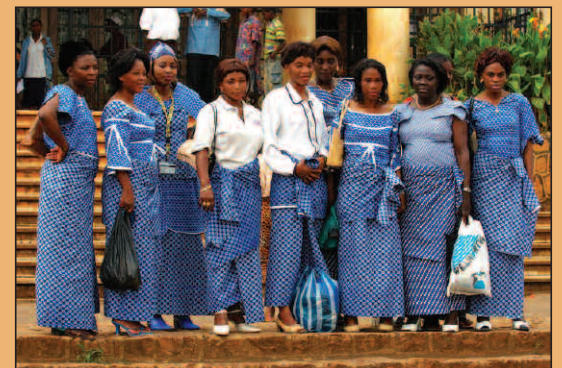
Congo women pose for a picture during womens day