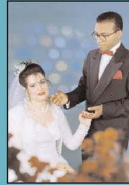
Newly wedded Egyptian Arab couple.

The textbook is designed incrementally so that idiomatic expressions, vocabulary, and grammatical points are presented and explained in a given unit and then used in almost all subsequent units. This method of presentation provides the learners with ample opportunities to use the linguistic items and structures they have learned