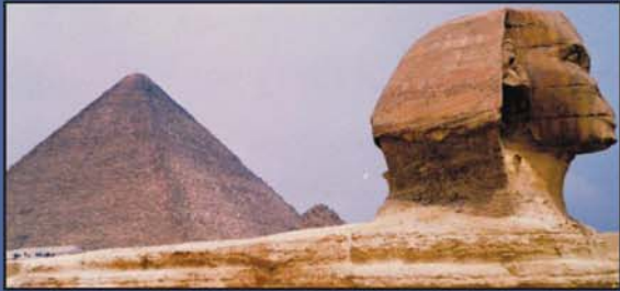
The great sphinx of Egypt.

DARDASHA: LET'S SPEAK EGYPTIAN ARABIC is an invaluable resource for Arabic teachers, instructors and students.