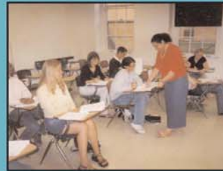
Students learning Arabic.

expressions are presented in a variety of ways such as dialogues, monologues, stories, jokes, etc. to provide a variety of presentation modes.