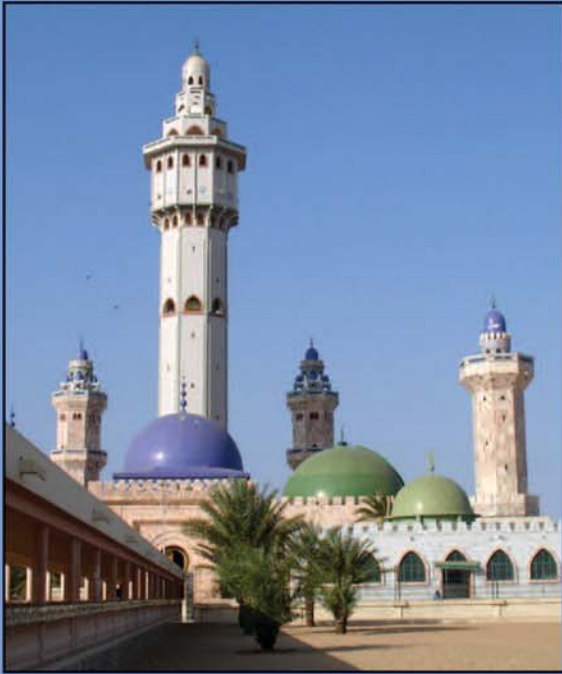
Mosque in Touba, Senegal

4231 Humanities Building, 455 North Park Street, Madison, WI 53706 Phone: (608) 265-7905 Fax: (608) 265-7904 nalrc@mailplus.wisc.edu http://lang.nalrc.wisc.edu/nalrc