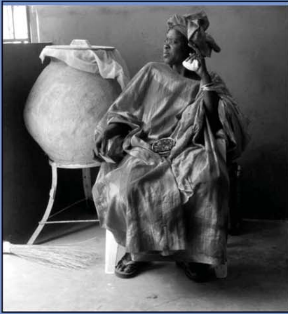
Wolof woman in traditional attire