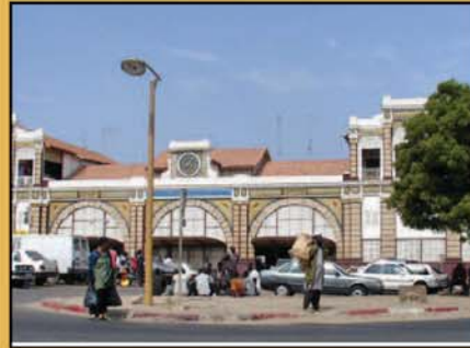
Train station in Dakar, Senegal

In the "Wolof-English Dictionary" section, each word is followed by all its grammatical functions; and for each entry, sentence examples are available to assist in the understanding of the significance of the word. The dictionary contains over 8,000 entries, which are however minus the nominal and verbal suffixes. It also contains many scientific words provided by some of the leading Wolof professionals, giving the book greater contemporary relevance.