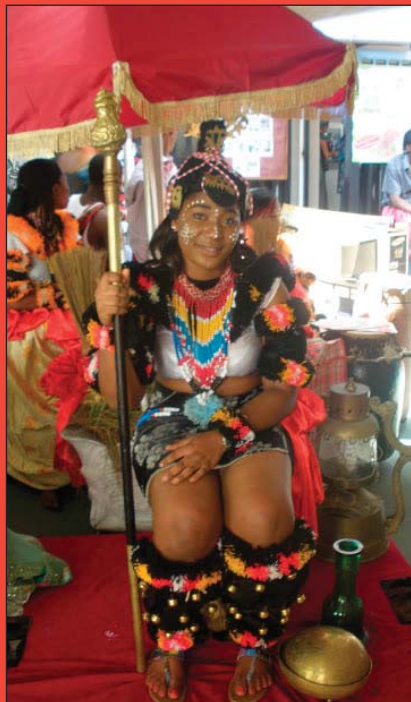
Ibibio bride looking fresh after Mbopo ritual

Ibibio are mostly in Southeastern Nigeria, predominately in Akwa Ibom state and is made up of the related Anaang community, Ibibio community and the Eket and the Oron Communities; although other groups usually understand the Ibibio language. Prior to the existence of Nigeria as a Nation, the Ibibio people were self-governed. The Ibibio people became a part of Eastern Nigeria of Nigeria under British colonial rule. During the Nigerian Civil War, Eastern region was split into three states. Southeastern State later renamed Cross-River state, out of which present day Akwa-ibom state was carved out of the Nigeria was where the Ibibios were located, one of the original twelve states of Nigeria after independence.