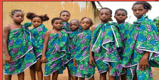
Ibibio kids from Akwa Ibom state