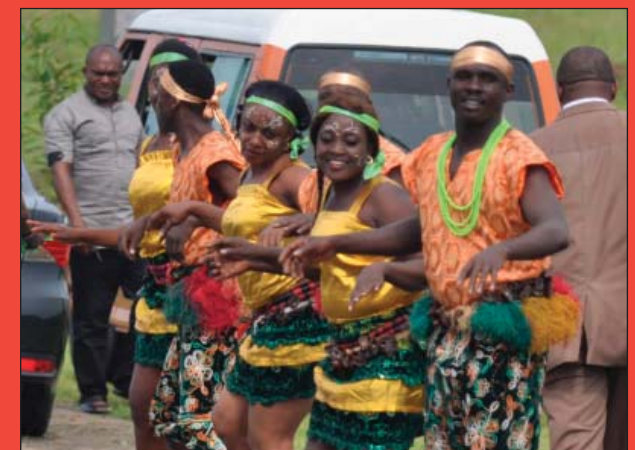
Ibibio cultural troupe