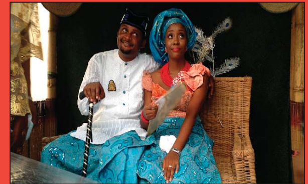
Ibibio man and his wife, Akwa Ibom state, Nigeria