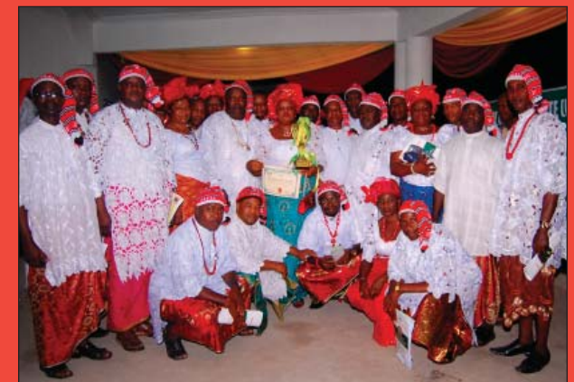
Mboho Mkarawa Ibibio | Eket Chapter