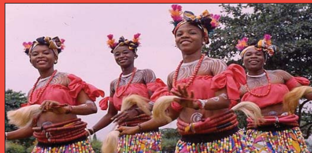
Ibibio cultural dancers from Akwa Ibom state, Nigeria

It will be interesting to know the tribe's culture and way of life dating back hundreds of years, how they were faring as a community before western civilization came in. Other attractions are the masks and accouterments of the "Ekpo society" which make up the greatest works of art in Ibibio society. Drumming and music are also important elements in Ekpe ceremonies.