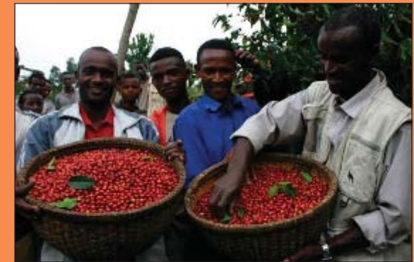
Sidama farmers exhibiting their coffee