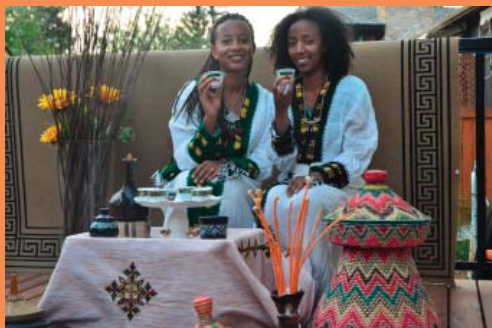
Sidamo women at a traditional Ethiopian Coffee Ceremony

The term Sidamo has also been used by some authors to refer to larger groupings of East Cushitic and even Omotic languages. The languages within this Sidamo grouping contain similar, alternating phonological features. The results from a research study conducted in the 1968-1969 concerning mutual intelligibility between the different Sidamo languages suggests that Sidamo is more closely related to Derasa (also called Gedeo) than the other Sidamo languages. Sidamo vocabulary has been influenced by Ge'ez and Amharic, and has in turn influenced Oromo vocabulary.