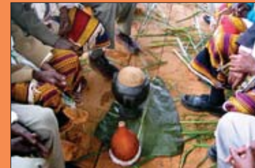
Sidama socio-economic culture