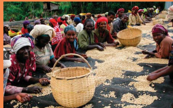
Sidamo produce the world's best coffee: Woman at a ferocoop

Today, Sidama area has only a small number of schools, and inadequate health services, though primary education has increased recently. The people have repeatedly complained that Sidama doesn't have regional autonomy in the country and asked for the government to give Sidama people their own region. Those against autonomy argue that with the SNNPR being a condensed region with the most ethnic groups concentrated in a small territory, carving out the boundaries that historically never existed and are often violently disputed between ethnicities in order to give the autonomy to the more than 40 ethnic groups is virtually impossible.