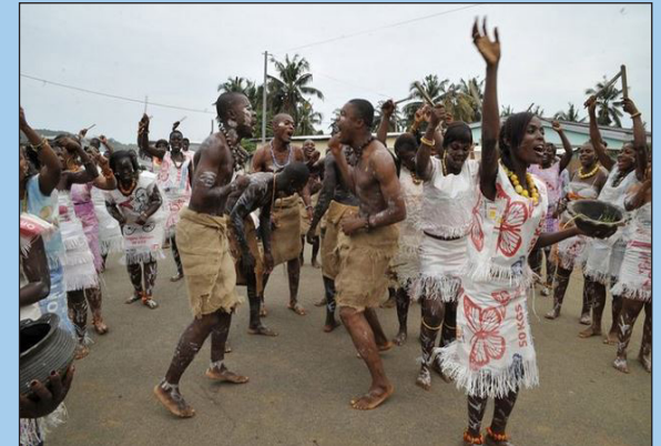
Kru people performing traditional dance, Ivory Coast