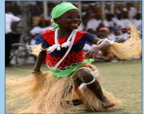
Grebo-Kru girl performing traditional dance, Liberia