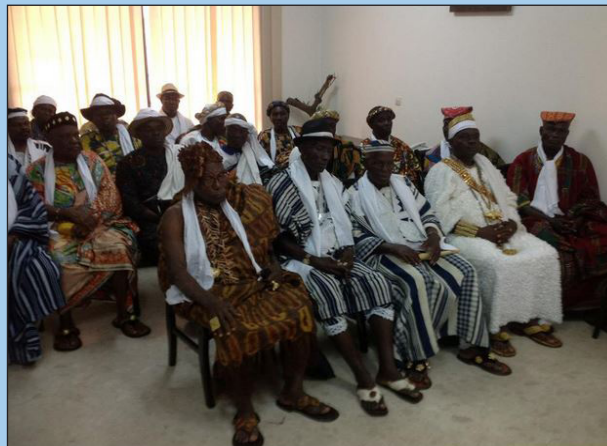
Ivorian Kru chiefs wearing their tappa dress

The Kru languages include many subgroups such as Kuwaa, Grebo, Belle, Belleh, Kwaa and many others. Categorization of communities based on cultural distinctiveness, historical or ethnic identity and socio-political autonomy may have brought about the large number of distinct Kru dialects; “Although the natives were in many respects similar in type and tribe, every village was an independent state; there was also very little intercommunication”. Overall, in 2010, Kru and associated languages were spoken by 95 percent of the approximate 3.5 million people in Liberia.