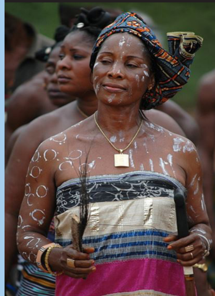
BHETE-KRU WOMAN IN TRADITIONAL DRESS, IVORY COAST

NATIONAL AFRICAN LANGUAGE RESOURCE CENTER (NALRC)