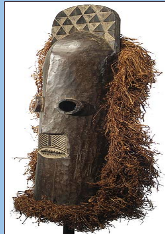
Pende/Azande Pumbu Mask

Zande is the largest of the Zande languages. It is spoken by the Azande, and is primarily in the northeast of the Democratic Republic of the Congo and the western South Sudan, but also in the eastern part of Central African Republic. Students interested in international development, government work, sociology, non-governmental organization (NGO), anthropology, linguistics, African art, or African history among other disciplines may be interested in studying Zande.