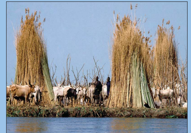
Azande people with cattle