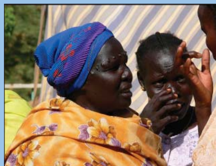
Sudanese Azande Woman