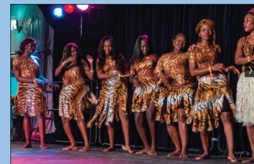
Azande Sudan Cultural Dance Group